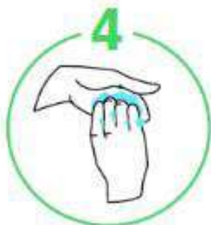
The back of the fingers