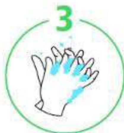
In between the fingers