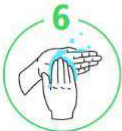
The tips of the fingers

Use a tissue to turn off the tap. Dry hands thoroughly.