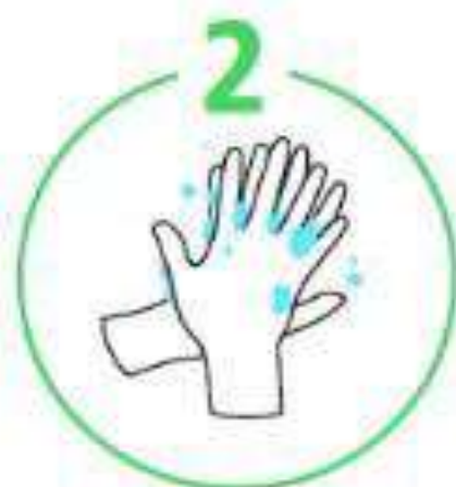
The backs of hands